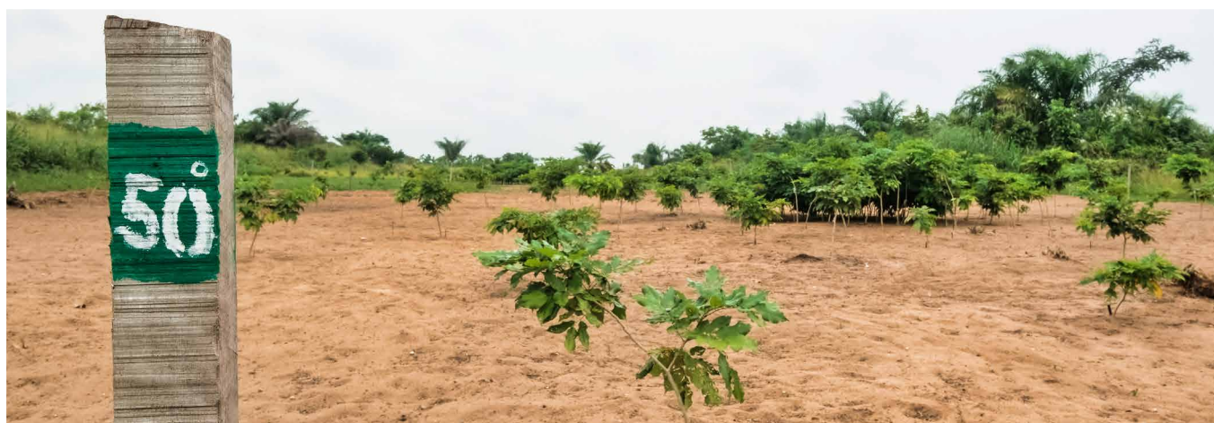
Reforestation efforts in Democratic Republic of the Congo.

Contributors: Raphael Tsanga (1), Mbonayem Liboum (1), Abdon Awono (1), Lydie Flora Essamba (1), Quentin Jungers (5), Florence Palla (6)